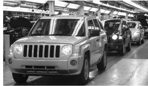
Jeep Patriot built right here in Belvidere, IL